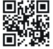
QR Code to District 22 Convention Website